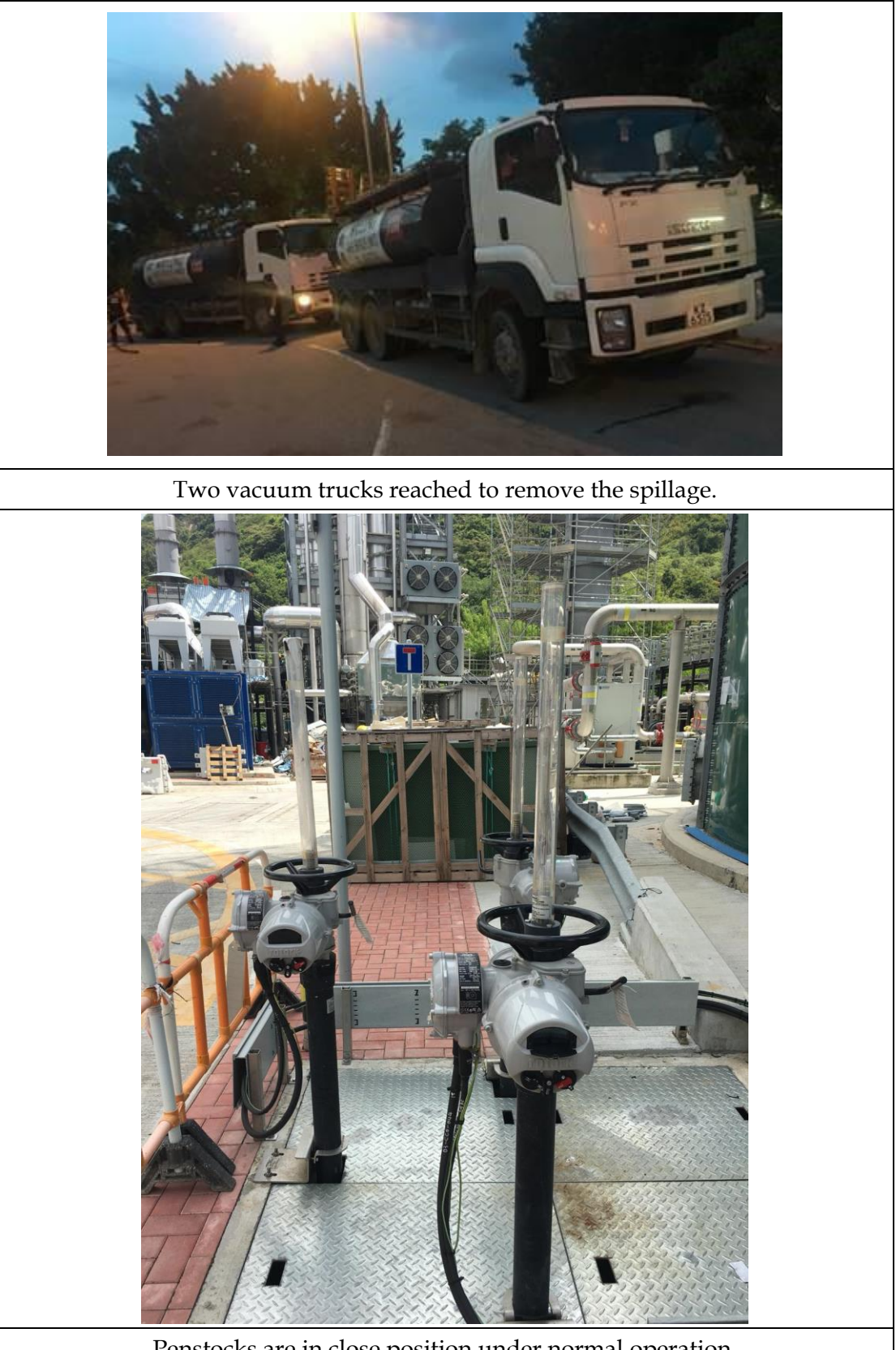
Penstocks are in close position under normal operation.